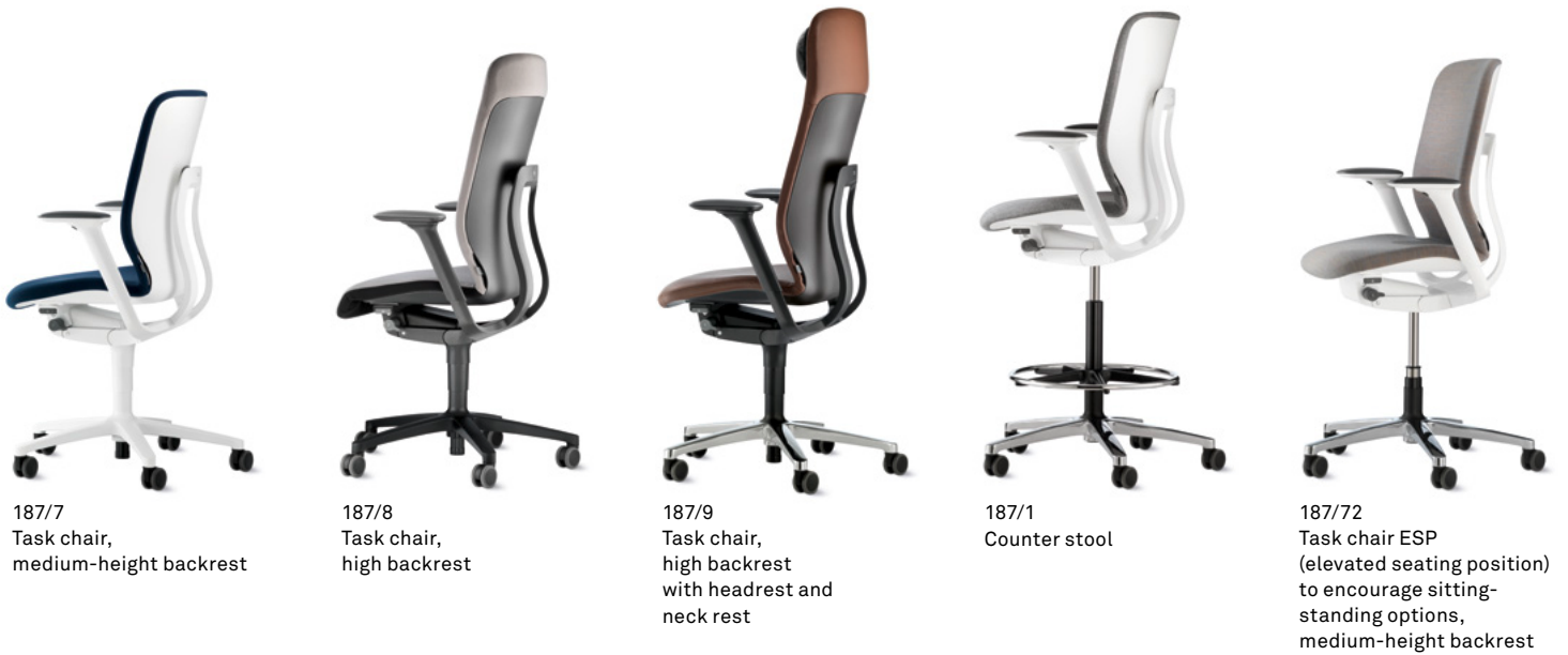
187/7 Task chair, medium-height backrest

The height of the armrests is adjustable by 100 mm at the touch of a button. The depth of the armrest pads on 3D armrests can also be extended by 50 mm and the width by 25 mm, 4D armrests can also rotate inwards and outwards by 25°.